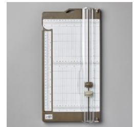
Paper Trimmer [152392] $25.00