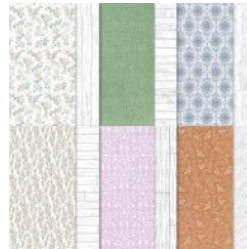
Heart & Home 12" X 12" (30.5 X 30.5 Cm) Designer Series Paper [157928] $11.50