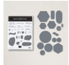
Hello Beautiful Bundle (English) [158047] $42.25