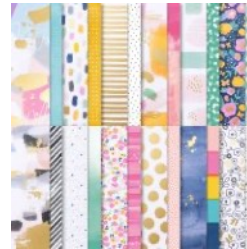
Abstract Beauty 4" X 6" (10.2 X 15.2 Cm) Specialty Designer Series Paper [158039] $15.00