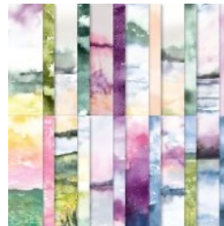
New Horizons 6" X 6" (15.2 X 15.2 Cm) Designer Series Paper [157768] $11.50