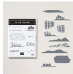
On The Horizon Bundle (English) [157779] $50.25