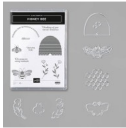
Honey Bee Bundle [153792] $41.25