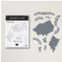
Blessings Of Home Bundle (English) [157939] $51.25