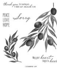
Olive Branch Cling Stamp Set (English) [159033] $22.00