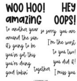
Amazing Phrasing Photopolymer Stamp Set (English) [159930] $0.00