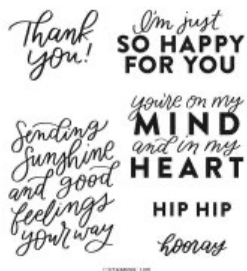
Good Feelings Cling Stamp Set (English) [158737] $24.00