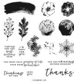
Season Of Chic Photopolymer Stamp Set (English) [158810] $27.00