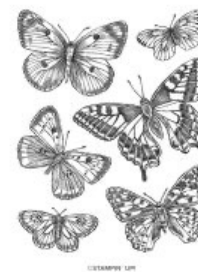
Butterfly Brilliance Cling Stamp Set [155092] $18.00