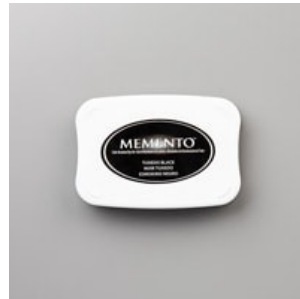
Tuxedo Black Memento Ink Pad [132708] $6.00