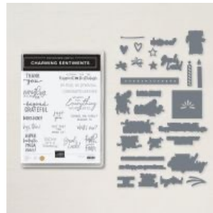
Charming Sentiments Bundle (English) [158734] $52.00