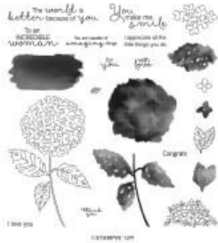
Hydrangea Haven Photopolymer Stamp Set [154470] $26.00

Use shapes and colors to create amazing backgrounds for 1 layer cards.