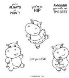
Hippest Hippos Cling Stamp Set (English) [159921] $0.00