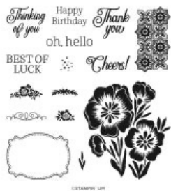
Lovely & Lasting Photopolymer Stamp Set (English) [158646] $22.00