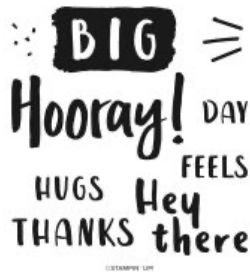
Big Hooray Photopolymer Stamp Set (English) [159128] $18.00