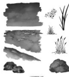
Oceanfront Photopolymer Stamp Set [157862] $22.00