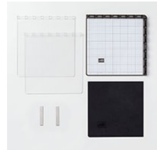
Stamparatus [146276] $49.00