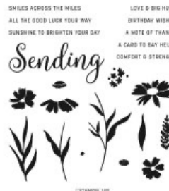
Sending Smiles Photopolymer Stamp Set (English) [158701] $22.00