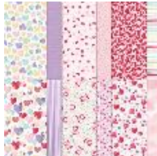
Sweet Talk 12" X 12" (30.5 X 30.5 Cm) Designer Series Paper [157616] $11.50