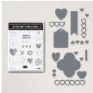
Sweet Conversations Bundle (English) [157624] $42.25