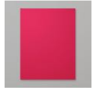
Real Red 8-1/2" X 11" Cardstock [102482] $8.75