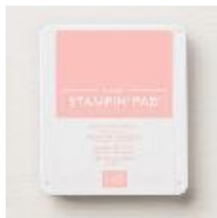
Blushing Bride Classic Stampin' Pad [147100] $7.50