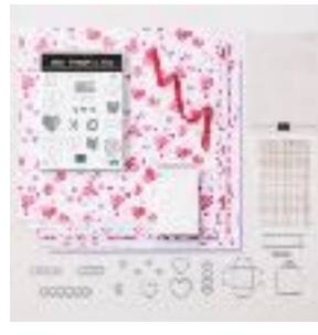
Sweet Talk Suite Collection (English) [157629] $86.25