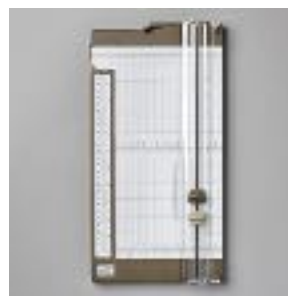
Paper Trimmer [152392] $25.00