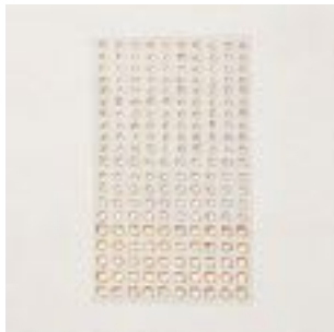
Iridescent Rhinestones Basic Jewels [158130] $7.50