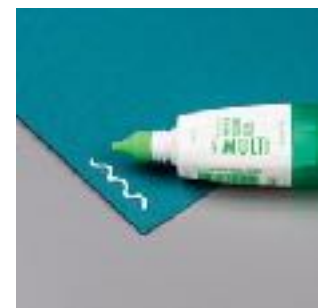
Multipurpose Liquid Glue [110755] $4.00