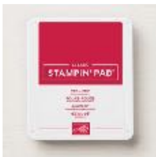
Real Red Classic Stampin' Pad [147084] $7.50