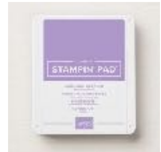
Highland Heather Classic Stampin' Pad [147103] $7.50