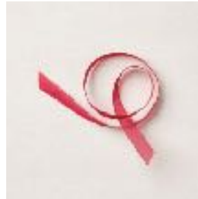
Real Red 3/8" (1 Cm) Faux Linen Ribbon [158129] $7.50