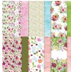
Awash In Beauty 12" X 12" (30.5 X 30.5 Cm) Designer Series Paper [158973] $12.00