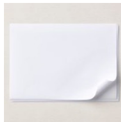
Stampin' Up! Masking Paper [155480] $7.00