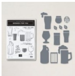
Brewed For You Bundle (English) [159093] $37.75