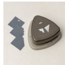
Very Best Trio Punch [159878] $21.00