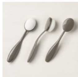
Blending Brushes [153611] $12.50