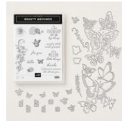
Beauty Abounds Cling Bundle [150617] $55.75