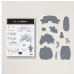
Hello Harvest Bundle (English) [159644] $49.50