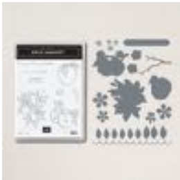
Apple Harvest Bundle (English) [162526] $53.00