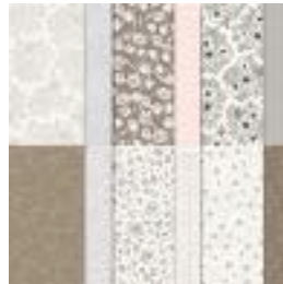
Abigail Rose 12" X 12" (30.5 X 30.5 Cm) Designer Series Paper [159037] $12.00