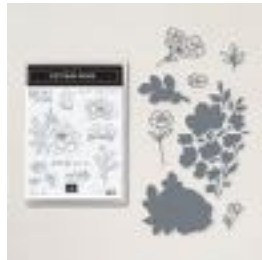
Cottage Rose Bundle (English) [159048] $53.00