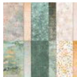
Texture Chic 12" X 12" (30.5 X 30.5 Cm) Specialty Designer Series Paper [158808] $15.00