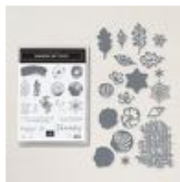
Season Of Chic Bundle (English) [158816] $57.50