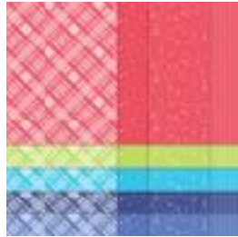
2022–2024 In Color™ 6" X 6" (15.2 X 15.2 Cm) Designer Series Paper [159253] $12.00