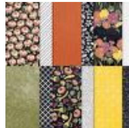
Rustic Harvest 12" X 12" (30.5 X 30.5 Cm) Designer Series Paper [159633] $12.00