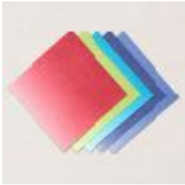
2022–2024 In Color 6" X 6" (15.2 X 15.2 Cm) Glimmer Paper [159246] $12.00

This technique makes 4 cards at one time.