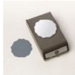
Decorative Circle Punch [159174] $19.00