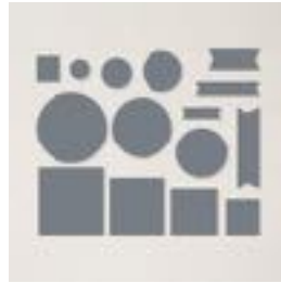
Stylish Shapes Dies [159183] $30.00