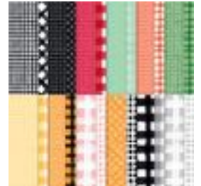
Gingham Cottage 12" X 12" (30,5 X 30,5 Cm) Designer Series Paper [159651] $30.00