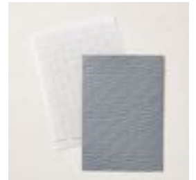
Gingham Embossing Folder [157627] $7.50