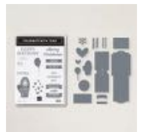
Celebrate With Tags Bundle (English) [159867] $55.75