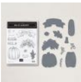
Hello Harvest Bundle (English) [159644] $49.50