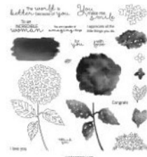
Hydrangea Haven Photopolymer Stamp Set [154470] $26.00