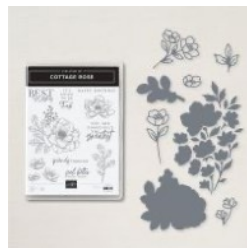
Cottage Rose Bundle (English) [159048] $53.00