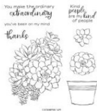
Simply Succulents Cling Stamp Set [154480] $22.00