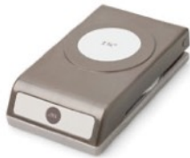
1-3/4" (4.4 Cm) Circle Punch [119850] $22.00