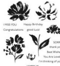
Art Gallery Photopolymer Stamp Set [158201] $22.00