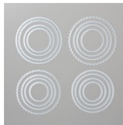
Layering Circles Dies [151770] $35.00