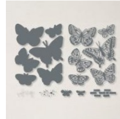
Brilliant Wings Dies [155523] $44.00