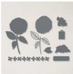
Hydrangea Dies [154326] $32.00