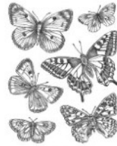
Butterfly Brilliance Cling Stamp Set [155092] $18.00