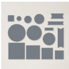
Stylish Shapes Dies [159183] $30.00