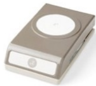
2" (5.1 Cm) Circle Punch [133782] $22.00