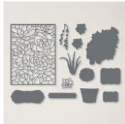
Potted Succulents Dies [154330] $39.00