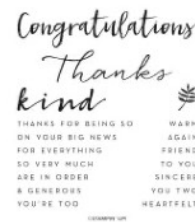
Kind & Sincere Cling Stamp Set (English) [160739] $26.00