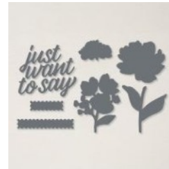
Floral Gallery Dies [154316] $34.00