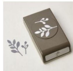
Bough Punch [157711] $22.00