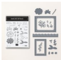
Darling Details Bundle [161371] $54.00