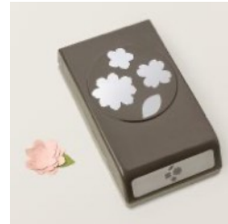
Petal Park Builder Punch [160576] $22.00