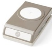
2" (5.1 Cm) Circle Punch [133782] $22.00