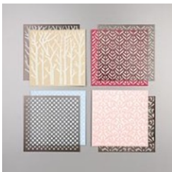
Basic Pattern Decorative Masks [150697] $8.00