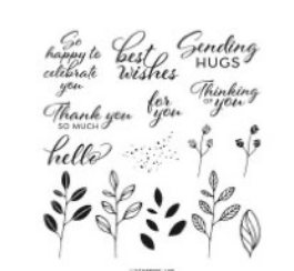
Layering Leaves Photopolymer Stamp Set (English) [161277] $24.00