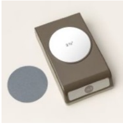
2 3/8" (6 Cm) Circle Punch [161354] $22.00