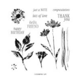
Inked & Tiled Cling Stamp Set (English) [161158] $27.00