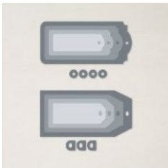
Tailor Made Tags Dies [155563] $22.00