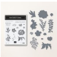
Textured Floral Bundle [161232] $52.00