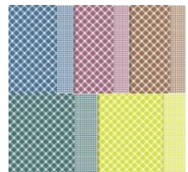
Glorious Gingham 6" X 6" (15.2 X 15.2 Cm) Designer Series Paper [163170] $10.50