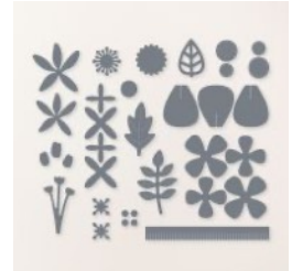
Paper Florist Dies [161284] $37.00