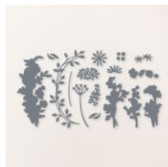
Dainty Delight Dies [160674] $36.00