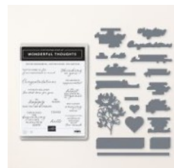
Wonderful Thoughts Bundle (English) [161494] $53.00