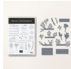
Timeless Arrangements Bundle (English) [161526] $54.00