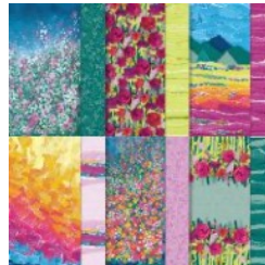
Masterfully Made 12" X 12" (30.5 X 30.5 Cm) Designer Series Paper [161192] $12.50