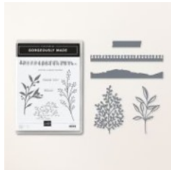
Gorgeously Made Bundle (English) [161203] $50.25