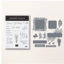
Christmas Classics Bundle (English) $52.00