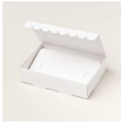
Scalloped Gift Card Boxes $7.00