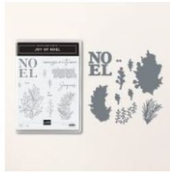
Joy Of Noel Bundle (English) $48.50