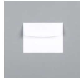
Basic White Medium Envelopes $8.50