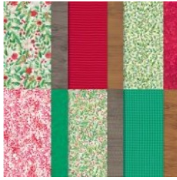
Joy Of Christmas 12" X 12" (30.5 X 30.5 Cm) Designer Series Paper $12.50