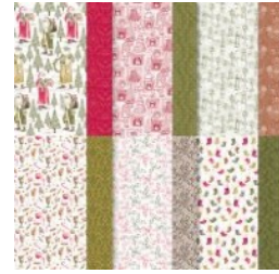
Traditions Of St. Nick 12" X 12" (30.5 X 30.5 Cm) Designer Series Paper $12.50