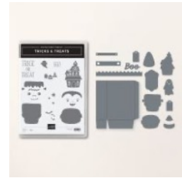
Tricks & Treats Bundle (English) $50.25