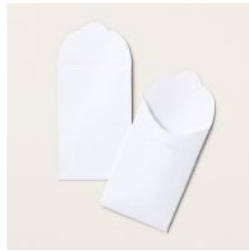
Classic Gift Card Envelopes $6.00