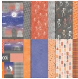
Them Bones 12" X 12" (30.5 X 30.5 Cm) Designer Series Paper $12.50