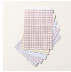
2023-2025 In Color Treat Bags $10.00