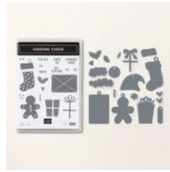
Sending Cheer Bundle (English) $53.00