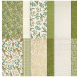
Season Of Green & Gold 12" X 12" (30.5 X 30.5 Cm) Specialty Designer Series Paper