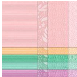
2024–2026 In Color™ 6" X 6" (15.2 X 15.2 Cm) Designer Series Paper