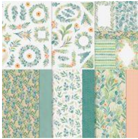
Frames & Flowers Specialty 12" X12" (30.5 X 30.5 Cm) Designer Series Paper