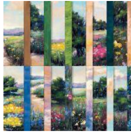
Meandering Meadows 6" X 6" (15.2 X 15.2 Cm) Designer Series Paper