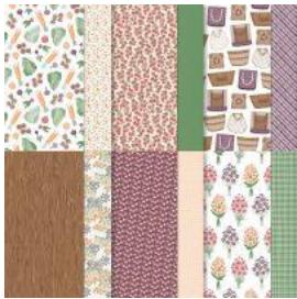
To Market 12" X 12" (30.5 X 30.5 Cm) Designer Series Paper