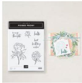
Poised Peony Cling Stamp Set (English)