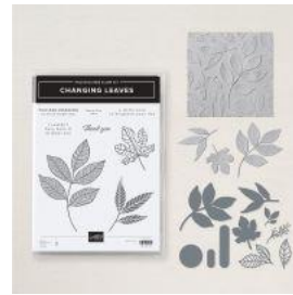
Changing Leaves Bundle (English)