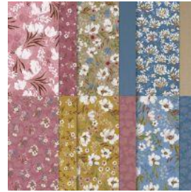
Wildly Flowering 12" X 12" (30.5 X 30.5 Cm) Designer Series Paper