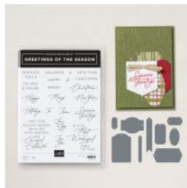
Greetings Of The Season Bundle (English)