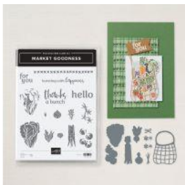
Market Goodness Bundle (English)