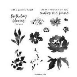
Textured Floral Photopolymer Stamp Set (English)