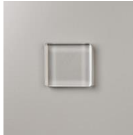
Clear Block D