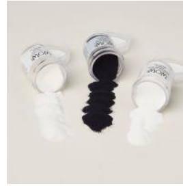
Basics Wow! Embossing Powder