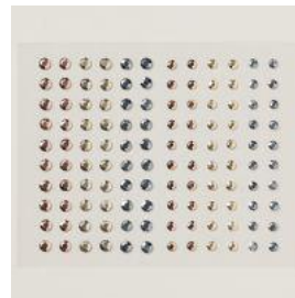
Adhesive Backed Metallic Gems