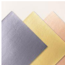
Textured Metallic 12" X 12" (30.5 X 30.5 Cm) Specialty Paper