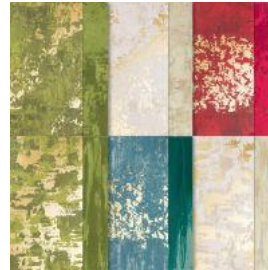
Season Of Elegance 12" X 12" (30.5 X 30.5 Cm) Specialty Designer Series Paper