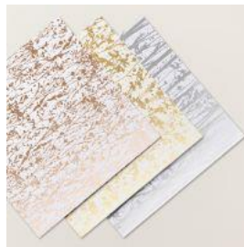
Naturally Gilded 12" X 12" (30.5 X 30.5 Cm) Specialty Designer Series Paper