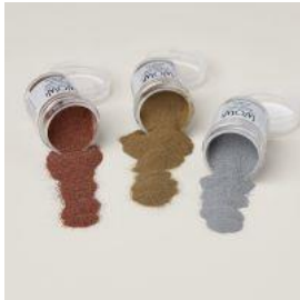
Metallics Wow! Embossing Powder