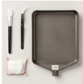
Embossing Additions Tool Kit