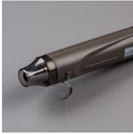
Heat Tool (Us And Canada)