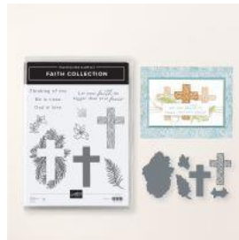
Faith Collection Bundle (English)