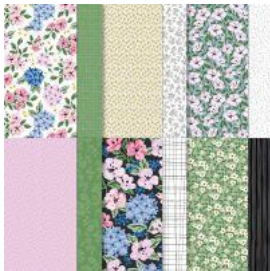
Lovely Garden 12" X 12" (30.5 X 30.5 Cm) Designer Series Paper