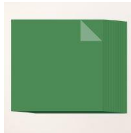
Garden Green 12" X 12" (30.5 X 30.5 Cm) Two Tone Cardstock