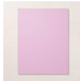
Fresh Freesia 8 1/2" X 11" Cardstock