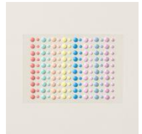
Rainbow Adhesive Backed Dots