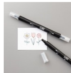
Blender Pens [102845] $14.00