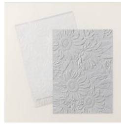
Sunflower 3 D Embossing Folder [166145] $12.00