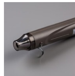
Heat Tool (Us And Canada) [129053] $32.00