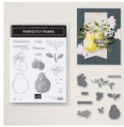
Perfectly Pears Bundle (English) [166154] $42.25