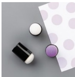
Sponge Daubers [133773] $7.50