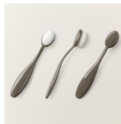
Small Blending Brushes [160518] $14.00