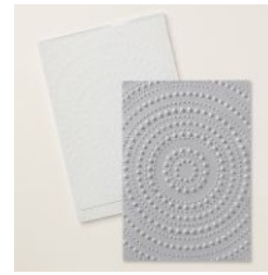
Dotted Circles 3 D Embossing Folder [163789] $12.00