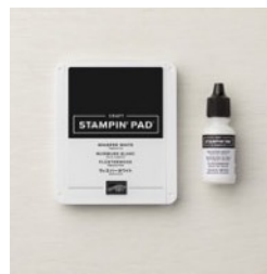
Uninked Stampin' Craft Pad & Whisper White Refill [147277] $10.50