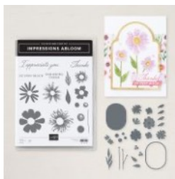
Impressions Abloom Bundle (English) [165611] $48.50