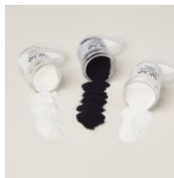
Basics Wow! Embossing Powder [165679] $21.00