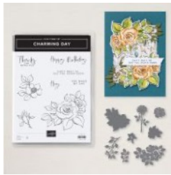
Charming Day Bundle (English) [166136] $52.00